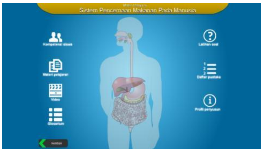
Figure 1. Display Menu on Human Food Digestive System Material

The material presented in this Biology learning media is the Digestive and Respiratory Systems in Class XI Humans Semester II. Presentation of material is presented in a language that can motivate students and learn and create an interactive learning atmosphere. The material presented is learning material that contains material about the disciplines being taught , learning videos, glossaries, practice questions, and other additional displays such as and bibliography. The display of the food digestive system material menu in humans in the teaching media can be seen in Figure 1 below.