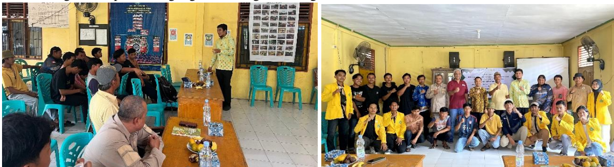
Figure 2. The workshop process for enhancing understanding of sustainable agriculture and digital farming

The workshop aimed to improve the understanding of young farmers regarding sustainable agriculture, eco-friendly practices, and digitalization in farming. The activities involved lectures, discussions, and hands-on demonstrations, as illustrated in Figure 2, which shows the process of conducting the workshop. This comprehensive approach ensured that participants gained both theoretical and practical knowledge. To evaluate the success of the workshop, a pre-test was conducted before the sessions, and a post-test was administered afterward. Both tests were designed to assess two main categories: participants' knowledge and their experiences or challenges in implementing digital farming technologies.